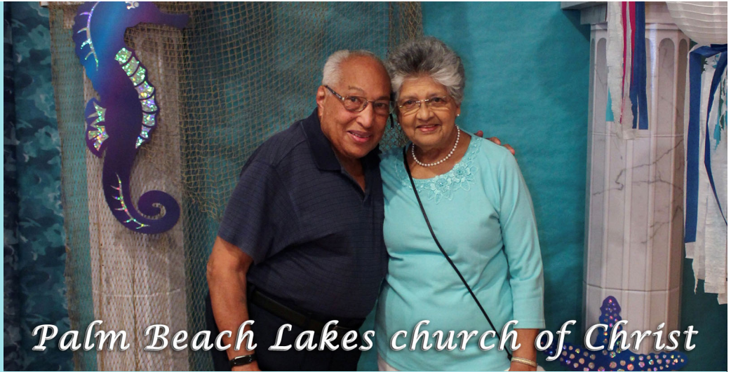
Palm Beach Lakes church of Christ