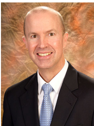
By David Sproule

The Bible is the best source to define difficult words and phrases