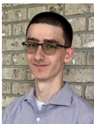
By Simon Tyson (Summer Intern)

Do we not realize that we owe our salvation to our older generation?