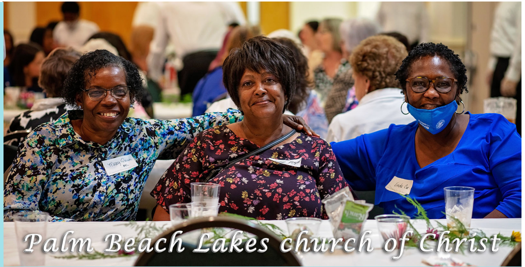
Palm Beach Lakes church of Christ

Phone ..... 561-848-1111 Fax ..... 561-848-1198 Website ..... www.pblcoc.org E-mail ..... office@pblcoc.org