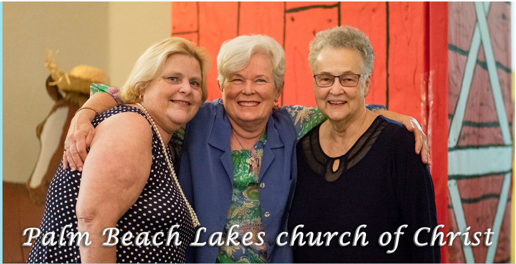
Palm Beach Lakes church of Christ