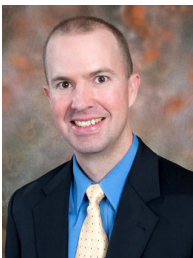
By David Sproule

What is the largest Greek number? What is the largest English number?