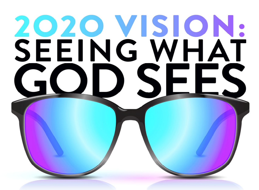
"BLESSED ARE THE EYES WHICH SEE THE THINGS YOU SEE" LUKE 10:23