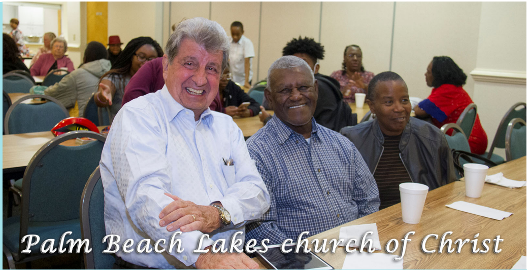
Palm Beach Lakes Church of Christ