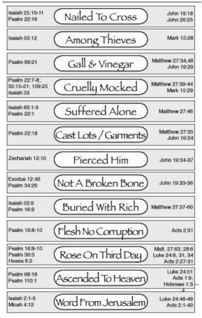
"ALL THINGS MUST BE FULFILLED WHICH WERE WRITTEN"