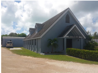
Building before storm