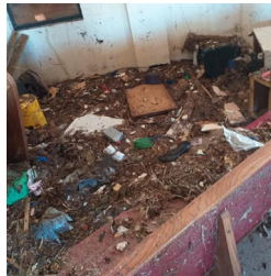
Photo inside building and severely damaged annex