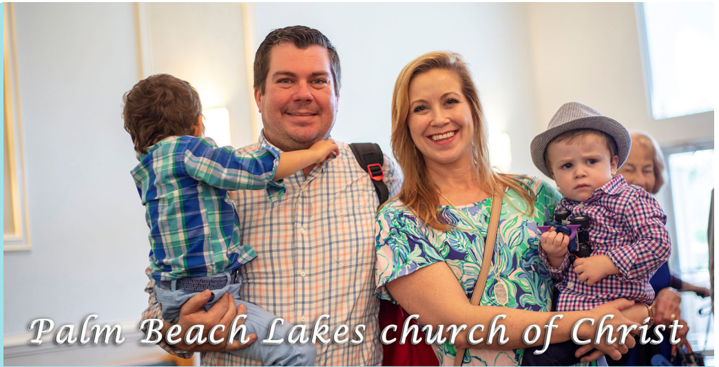
Palm Beach Lakes church of Christ