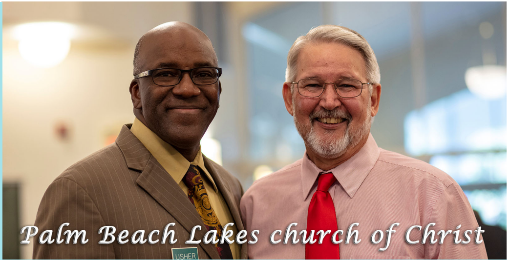
Palm Beach Lakes church of Christ