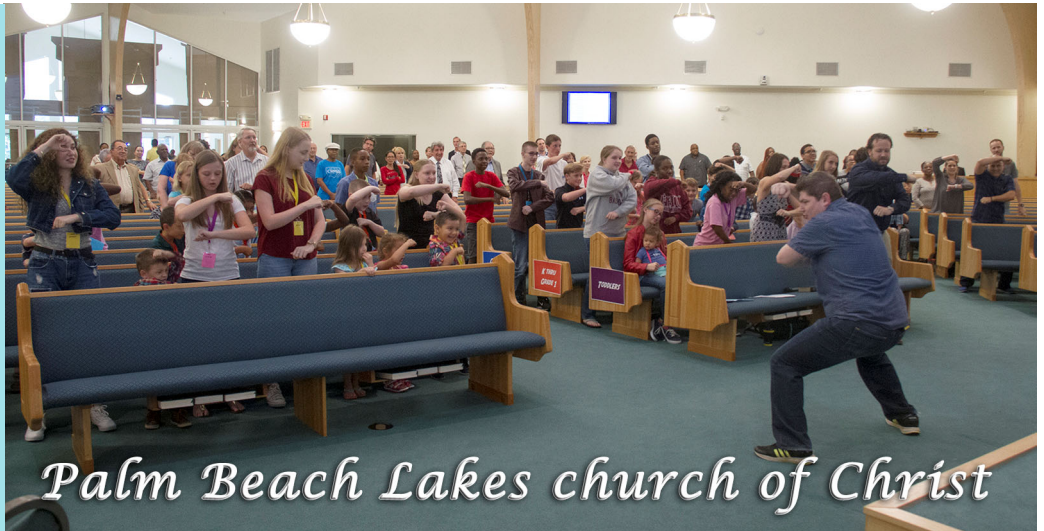
Palm Beach Lakes church of Christ