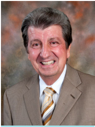
By Dan Jenkins