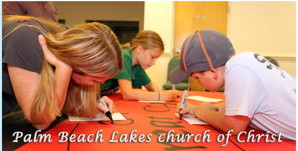
Palm Beach Lakes church of Christ

Phone..... 561-848-1111 Fax..... 561-848-1198 Website..... www.pblcoc.org E-mail ..... office@pblcoc.org