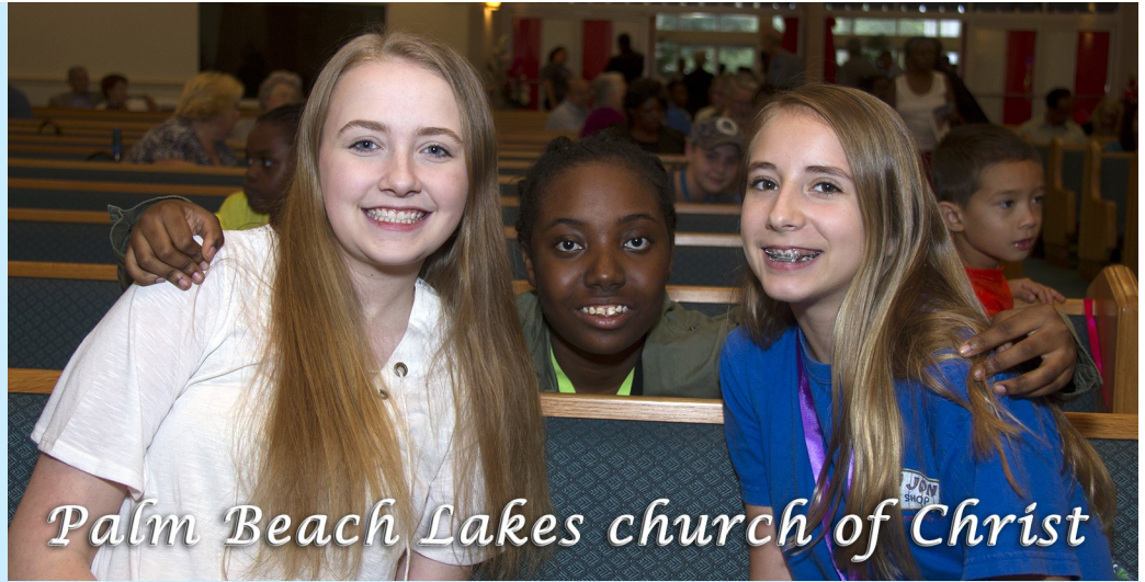
Palm Beach Lakes church of Christ

Phone.....561-848-1111 Fax.....561-848-1198 Website.....www.pblcoc.org E-mail .....office@pblcoc.org