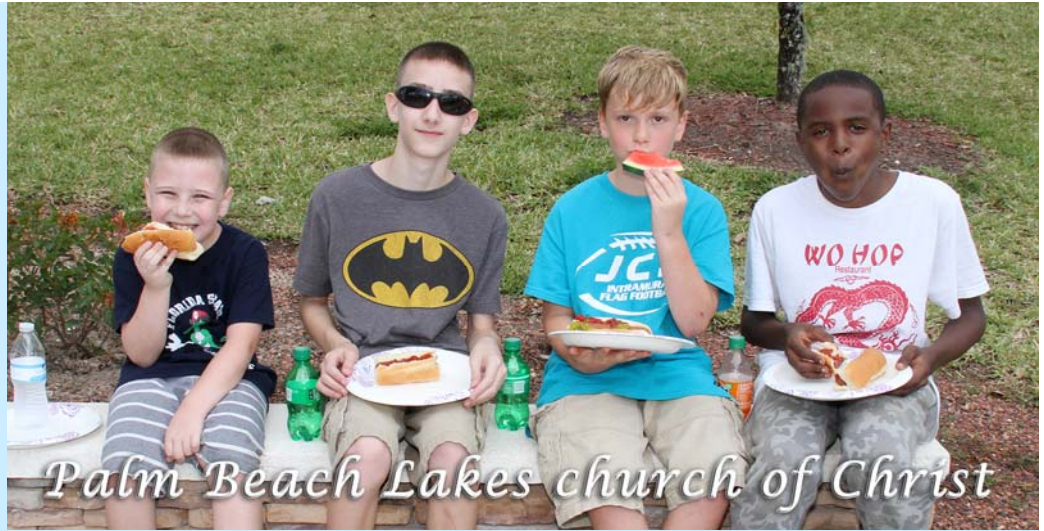
Palm Beach Lakes church of Christ