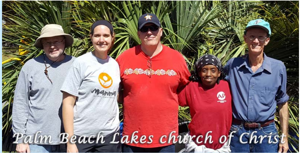
Palm Beach Lakes church of Christ