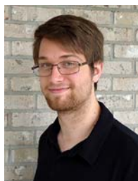
By Grant Fuller (Summer Intern)