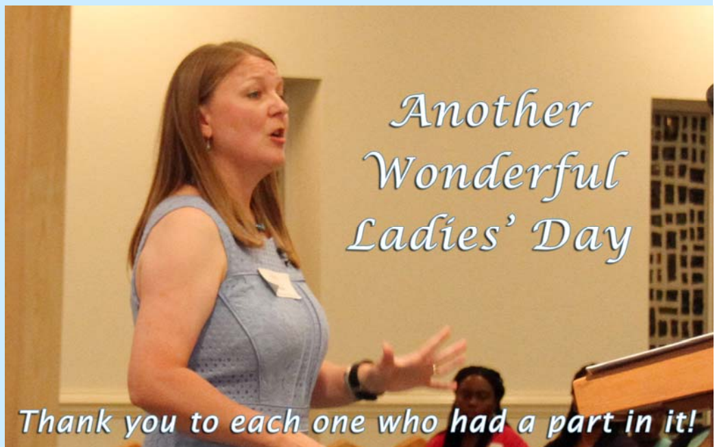
Another Wonderful Ladies' Day