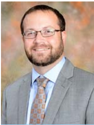
By Josh Black-