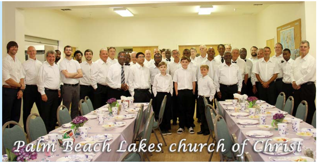
Palm Beach Lakes church of Christ