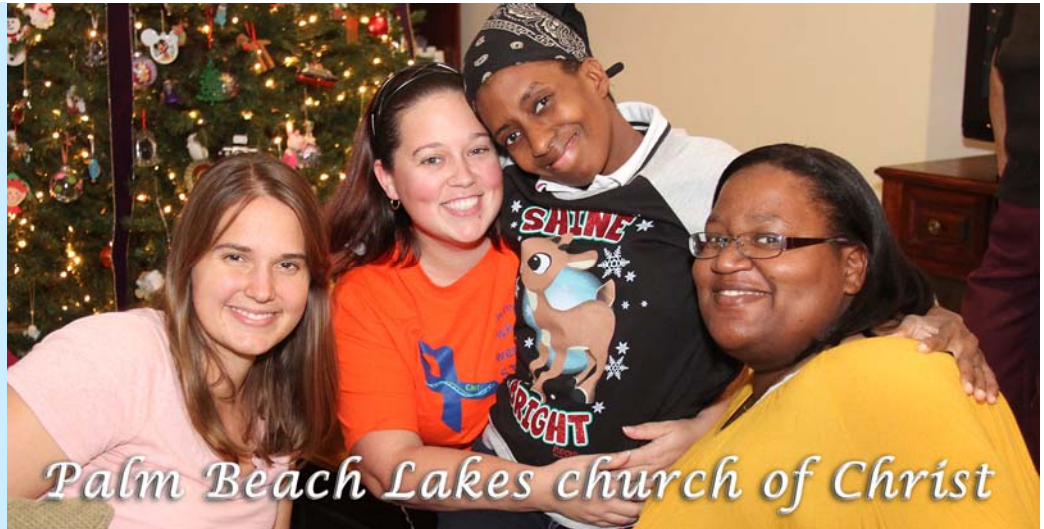
Palm Beach Lakes church of Christ