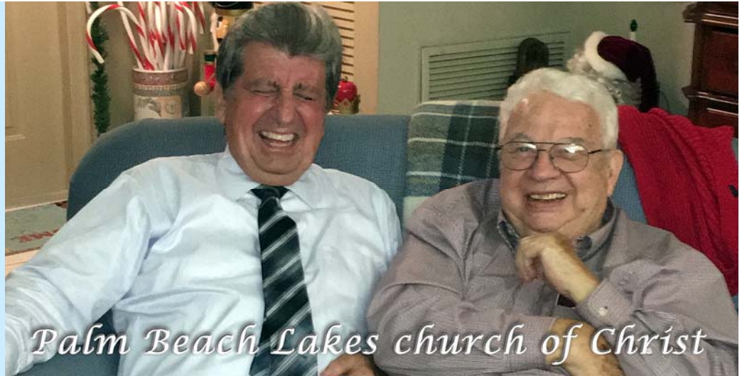
Palm Beach Lakes church of Christ