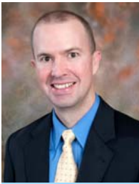
By David Sproule

Eaglets know that when they weary they can rest on wings of their parents