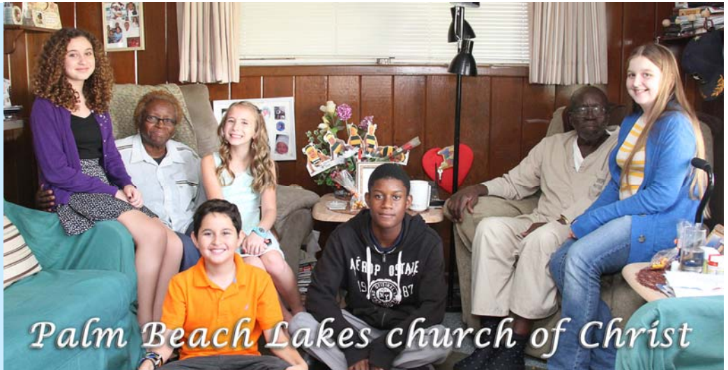
Palm Beach Lakes church of Christ