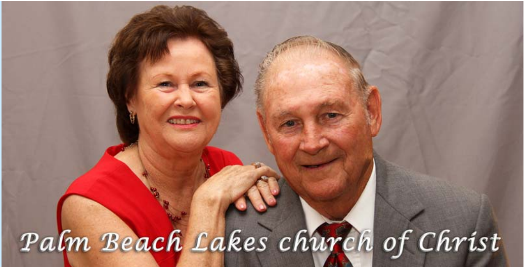
Palm Beach Lakes church of Christ