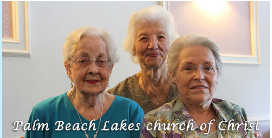
Palm Beach Lakes church of Christ