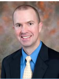
By David Sproule

The story of the death of Jesus would be so different without a good man